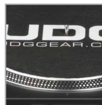
Fits Rane Twelve