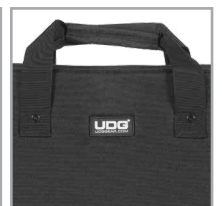
Convenient carry handles